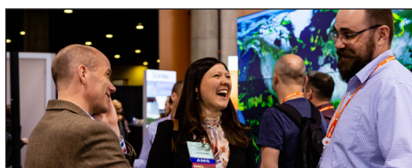
Exhibit Hall Networking Reception ($15,000)

A gathering of students eager to chart the course of their education and careers. Support the most energetic group at the Annual Meeting. Sponsors will have the opportunity to exhibit at the fair and engage graduate and undergraduate students who are deciding where to take the next step in their educational and professional lives.