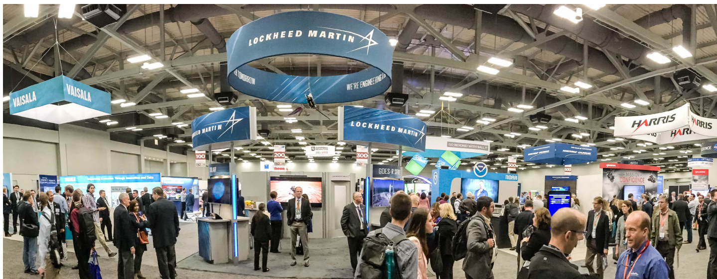
Exhibit at the Annual Meeting

Interested in exhibiting at the 100th AMS Annual Meeting? The AMS Annual Meeting is host to the largest exhibit program anywhere in the atmospheric, oceanic, and related sciences community. Exhibitors come from all over the United States and abroad, showcasing a wide range of products, publications, and services. Book your exhibit space today!